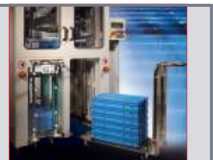
Manual feeding/ discharging over dollies