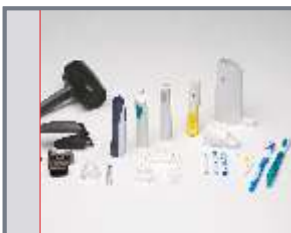
Whether glass body, plastic parts ...

Due to the automatic feeding of the work-piece carrier pallets can be reached uninterrupted and safe production for several hours. The feeding can also be done to save space on dollies.