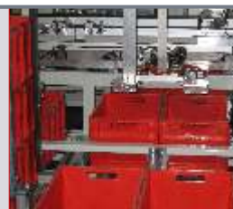
Double gripper system for KLT-boxes palletizing