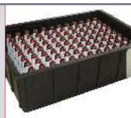
Plastic thermoforming trays for plastic moldings