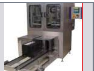
Automatic feeding/ discharging of pallets by double belt- or roller conveyor