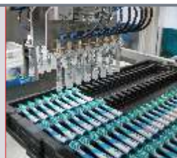
8-times gripper system for trayloading with tooth-brushes heads